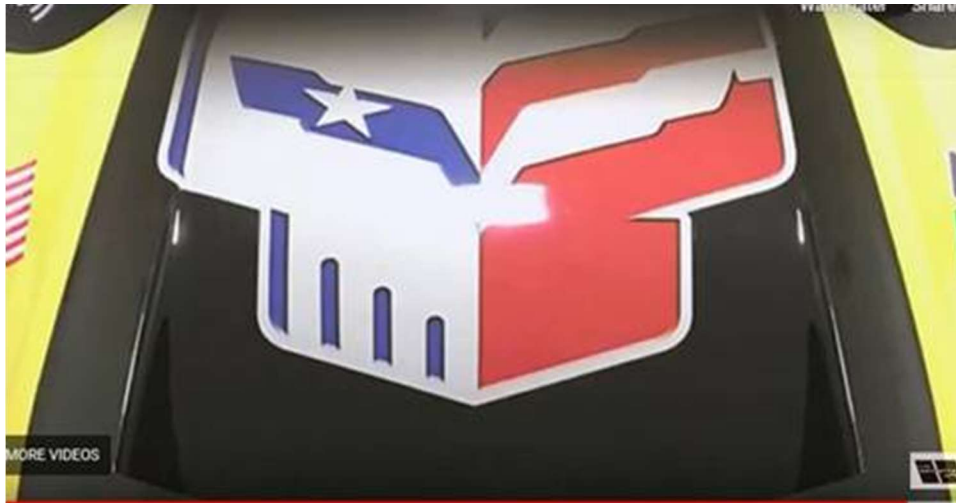
C8.R Jake logo, using new C8 deep 'V' emblem