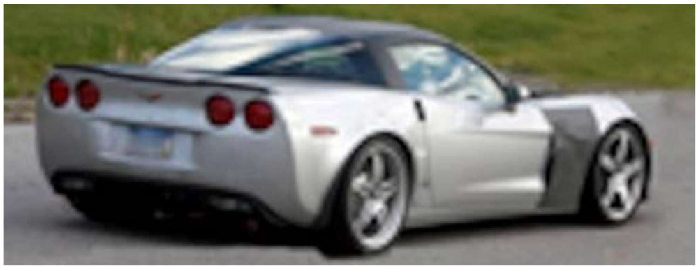
here it is up close and personal